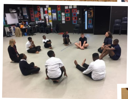
Pupils enjoying the opportunity to explore choreography in creative learning workshops with professional artists from York Dance.