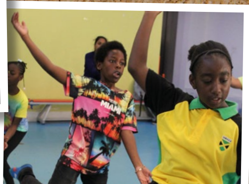
Primary Phase enjoyed learning Afro-Brazilian Samba Dancing and listening to traditional Brazilian music in their cultural day!