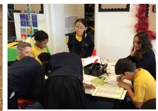
During TART week, pupils became specialists in their own area, and then worked in groups to coach their peers to become masters in their knowledge!