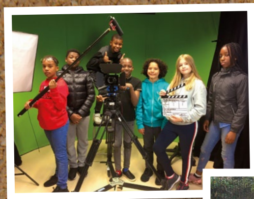
Media and Communications Scholars visit the Warner Bros studios to learn more about how the films were made.