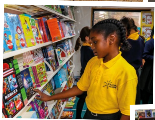
The Book Bus visited Primary Phase this term, allowing parents and pupils to take out books, encouraging the development of their reading and literacy skills.