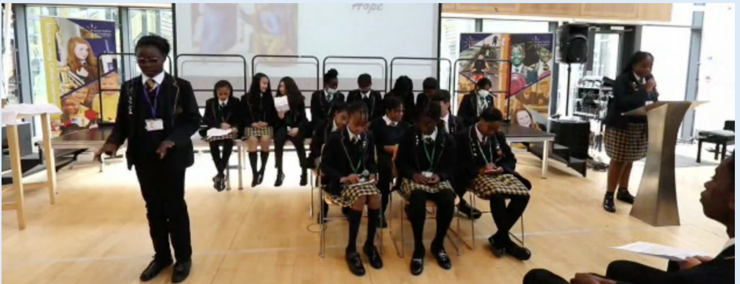
The Light Bearers lead our reflection through drama