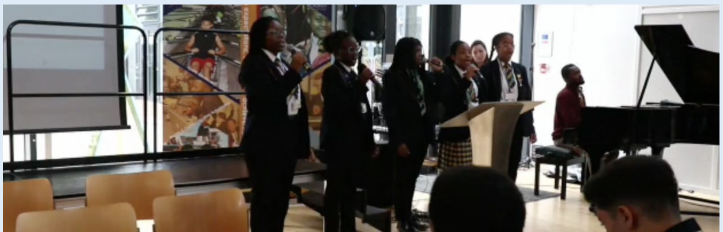
Our Year 7s, 8s and 9s sing