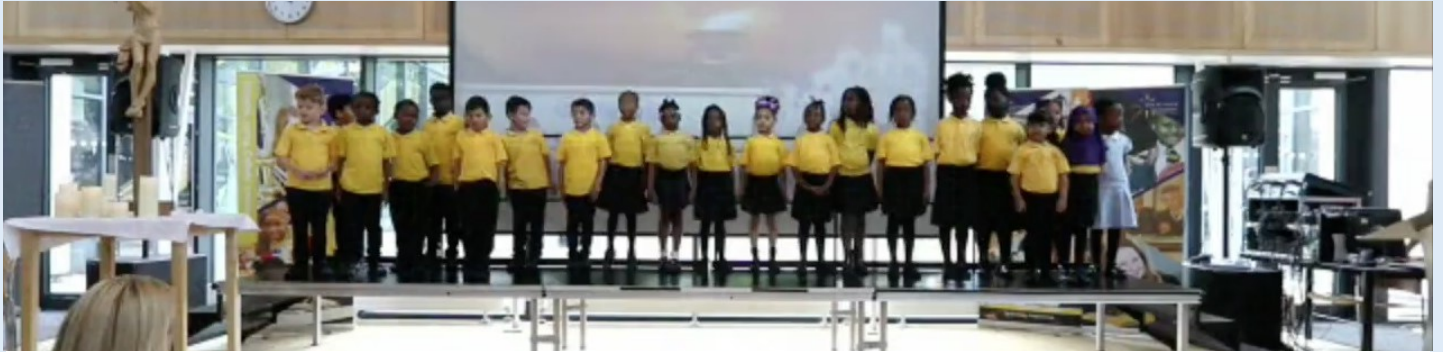
Year 1 sing 'Give me Joy in my Heart'

On 29th June we celebrated the Feast of St Peter and St Paul live in the Main Hall with our Year 7s and then our Year 8s and finally our Year 9s. Year 10 and Year 8 did not miss out on the celebrations but joined us virtually for the final liturgy of the day. This was once again a special celebration involving our whole school community.