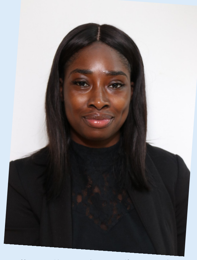
"For hard work and dedication in planning Big Hair Day and for being a fantastic Director of Learning!"