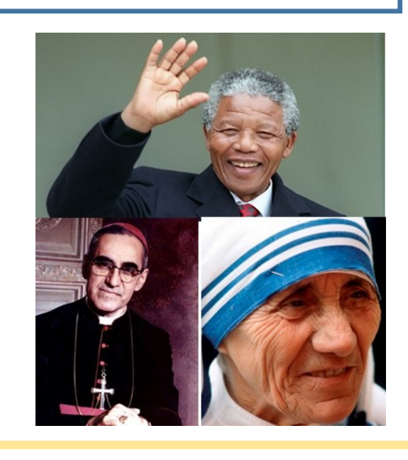
Integrity, courage, service