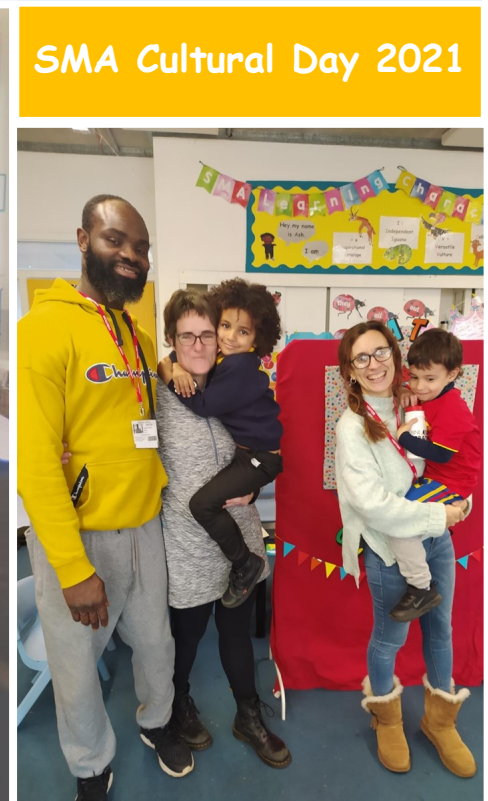
SMA Cultural Day 2021