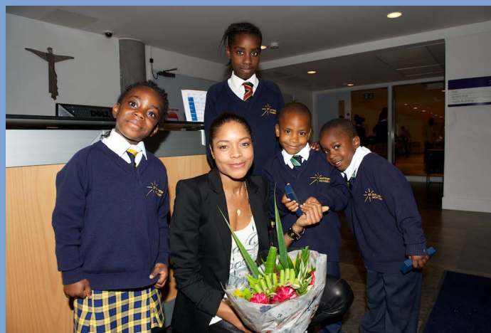
Students welcome Naomie Harris to the Academy

Our thanks to the Department of Business and Innovation and PRECIOUS Media for supporting the Yes WE can evening.