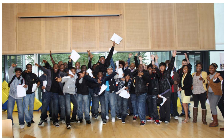
Class of 2011 celebrate their results